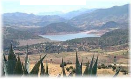
Lake Aït Adel